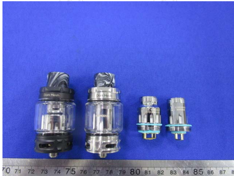
Dark Mesh Tank with 0.15 \Omega (Triple coils edition) 90W/0.15 \Omega (Single coil edition) 65W