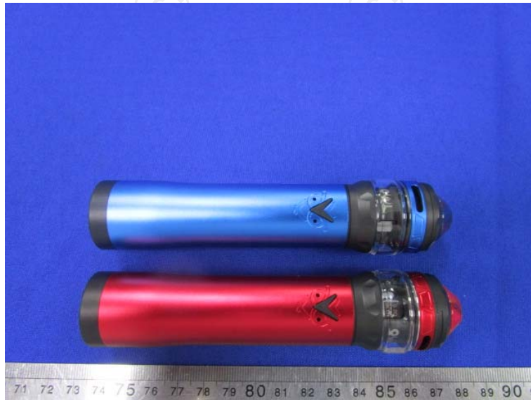
Owl kit with 0.2 \Omega /0.16 \Omega