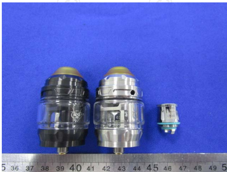
OWL Tank with 0.16ohm/0.2ohm